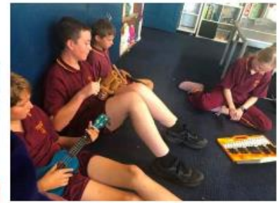
Ukelele chords and glockenspiel melodies