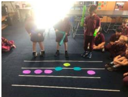
Pitch; learning the staff