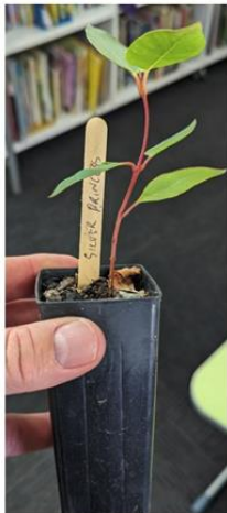
Silver Princess Gum

There will be more available in the near future if we sell out.