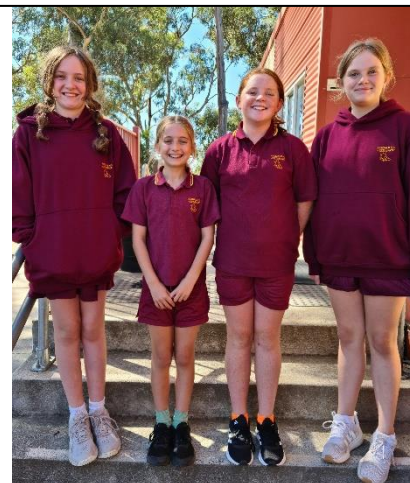
Some of the Band & Choir leaders